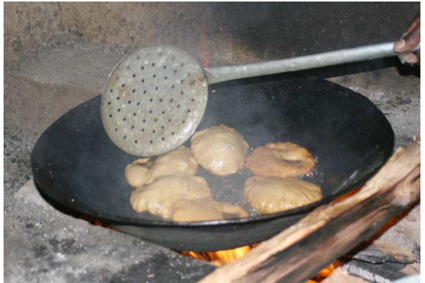
Making fried donuts at the Blessing Bakery in Kenya.