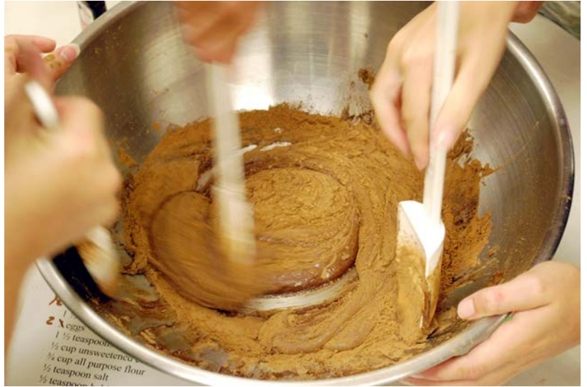
Mixing batter for cookies at Soapstone UMC in North Carolina.